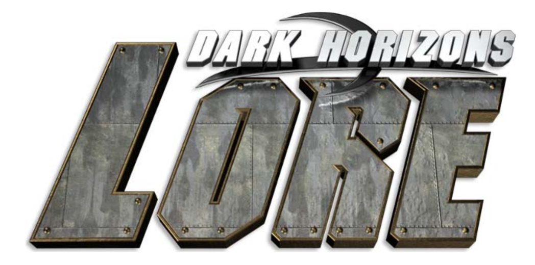
Dark Horizons - Lore d20 Edition